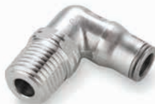
Prestolok® PLS Stainless Steel Visit the webpage