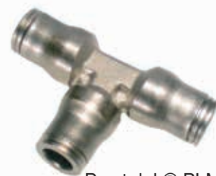
Prestolok® PLM Electroless Nickel Plated Visit the webpage

Silicone Free push-to-connect fitting with FKM seal offering excellent resistance to aggressive wash-down environments. The smooth surface design reduces retention zones for safe and easy cleaning. Available in NPT, BSPT, BSPP and Metric threads.