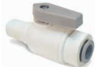
LIQUIfit™ Ball Valve