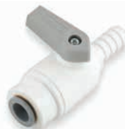
Polypropylene Ball Valve