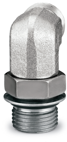
Current SAE Adjustable Port Stud