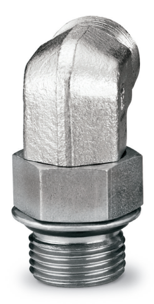
Parker's SAE Robust Port Stud

O-ring pinch can also happen with SAE adjustable port ends due to thread exposure below the locknut. This can lead to a deformed backup washer, a pinched O-ring and an O-ring extrusion gap with leak potential. To fix this, Parker created the Robust Port Stud™ that features a longer locknut to cover the uppermost threads on SAE adjustable port end fittings, removing the potential for backup washer damage and leaks.